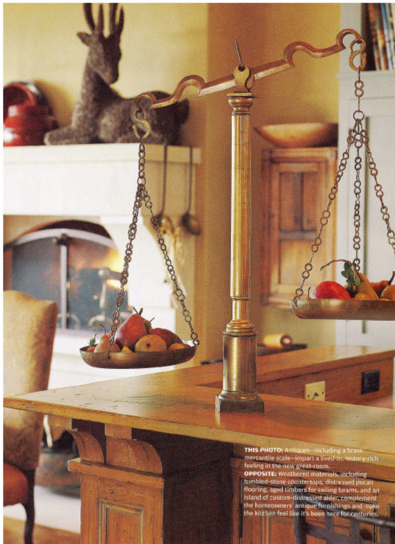
THIS PHOTO: Antiques—including a brass mercantile scale—impart a lived-in, history-rich feeling in the new great-room. OPPOSITE: Weathered materials, including tumbled-stone countertops, distressed pecan flooring, aged timbers for ceiling beams, and an island of custom-distressed alder, complement the homeowners' antique furnishings and make the kitchen feel like it's been here for centuries.