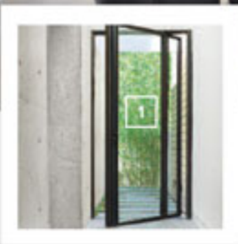
1 ENTRY DOOR Argent Fabrication Seattle, WA 206.438.0068